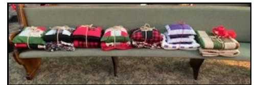
Blessing of the Bethlehem Quilts